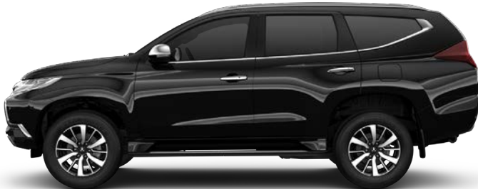
Cosmos Black (P)