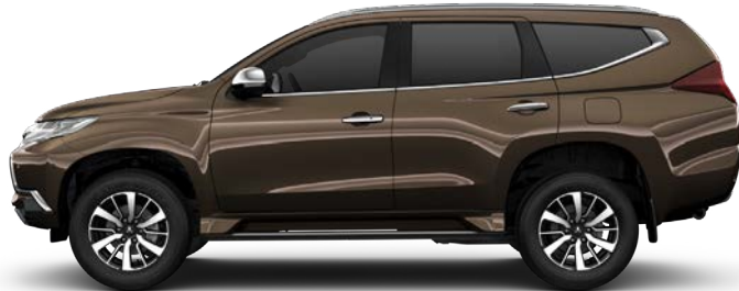
Deep Bronze (M)