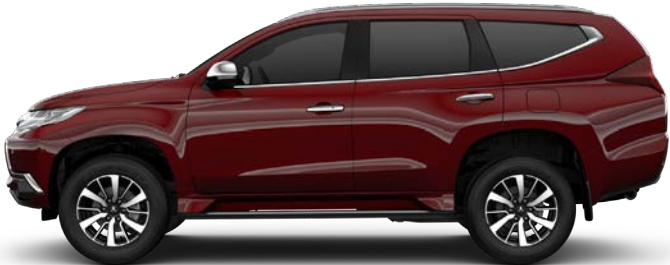
Imperial red (P)