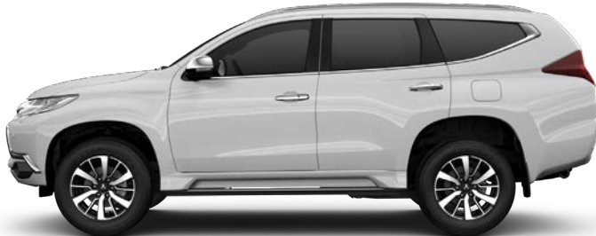
Polar White (S)