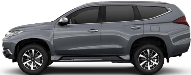
Atlantic Grey (M)