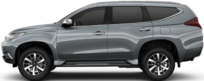
Sterling Silver (M)